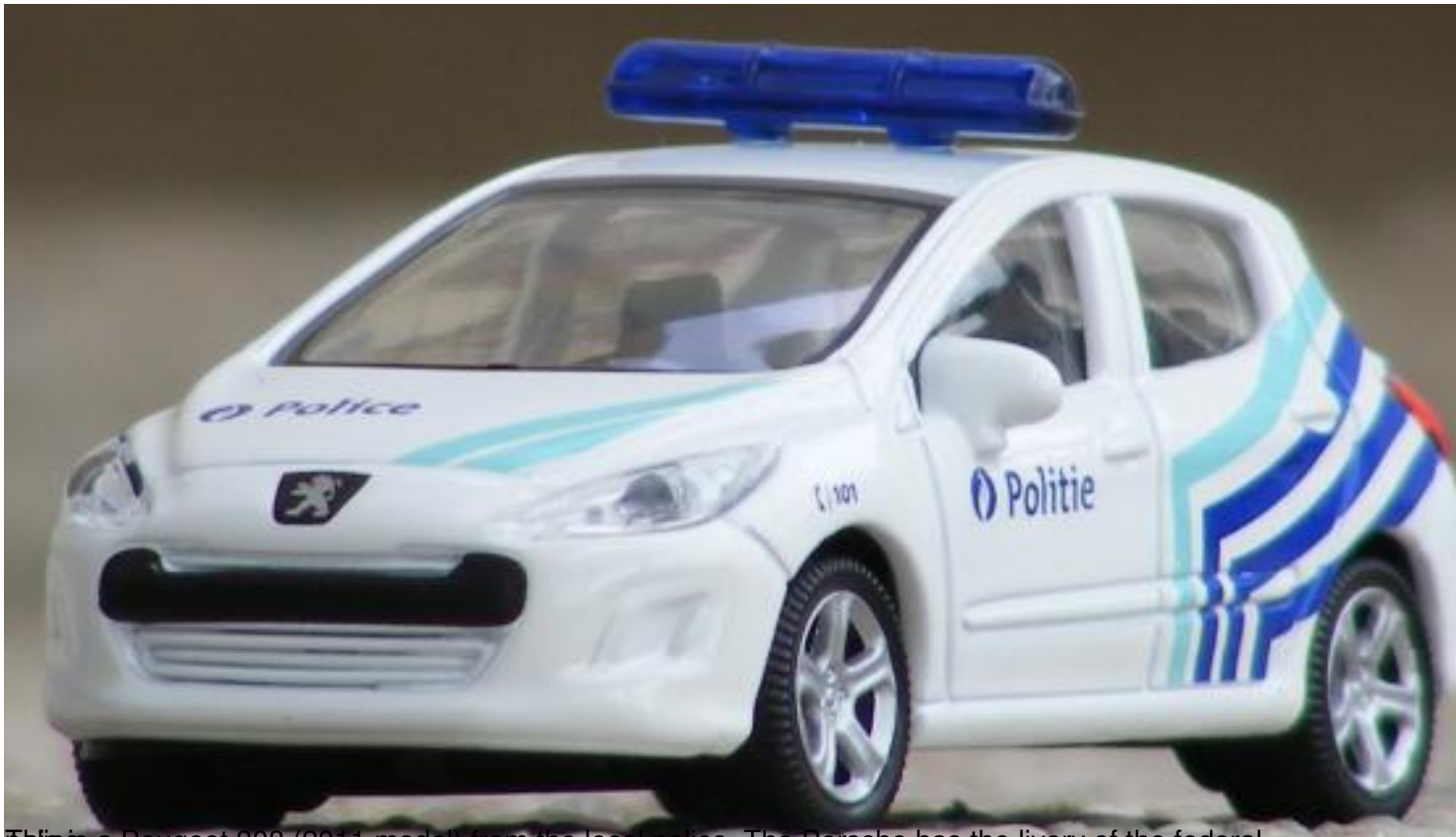
This is a Peugeot 308 (2011 model) from the local police. The Porsche has the livery of the federal