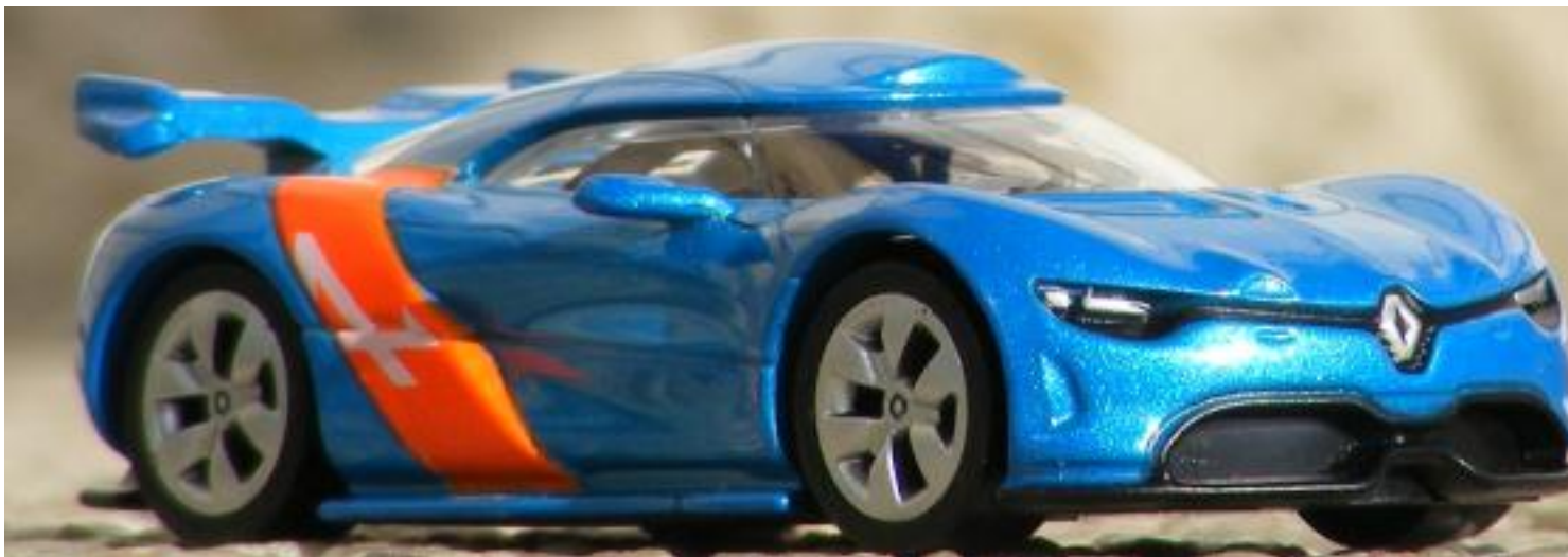
Renault Alpine A110-50

Posted by jclevering - 18 Nov 2013 12:57