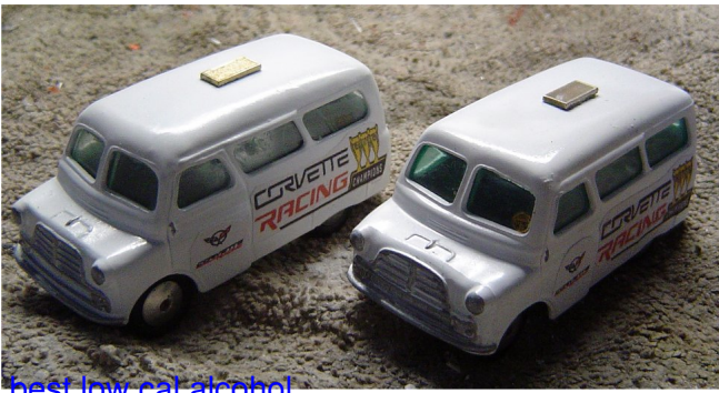
best low cal alcohol