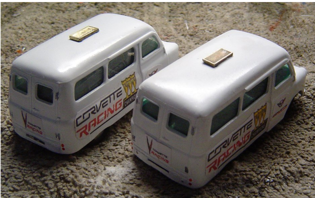
short term health goals

Corvette racing team stickers made and applied. Yes, the toolboxes are supposed to be inside.