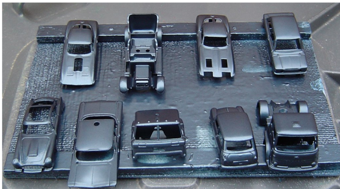
google maps nearest gas station